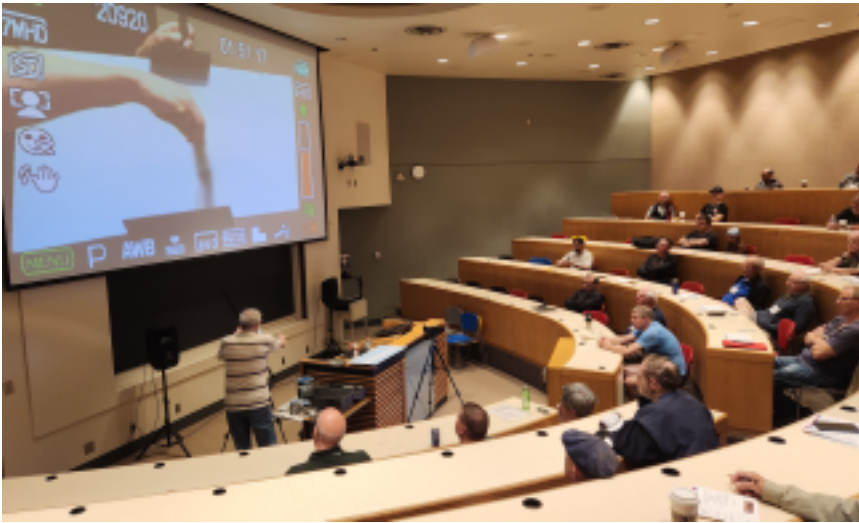
LEFT: A clinic being presented in the smaller of the two lecture halls.