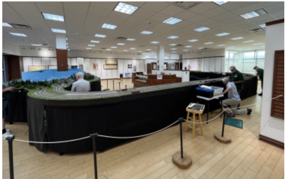
RIGHT: The layout with club members at work, as seen from the right side of the store space. The space has excellent general lighting.