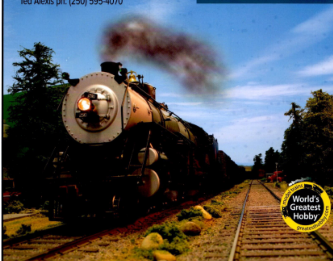
Layout by Wayne Paulsen