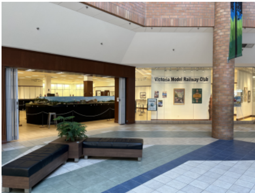
ABOVE: Victoria Model Railway Club's layout installed in an unused store space in Tillicum Mall.

We will continue to look for a long term home but the short term stay at Tillicum Centre was a rewarding experience and we encourage other model railway clubs to pursue a similar arrangement in their region. There is a possibility of going back to Tillicum Centre in the new year which we would welcome. The down side of free space in a shopping mall is that we will have to move out when a paying tenant is found, but until then we get to promote the hobby and play with our trains!