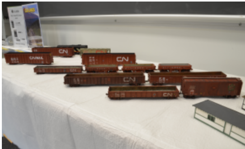
LEFT: A few models built by Marc Simpson on display in the model display room.