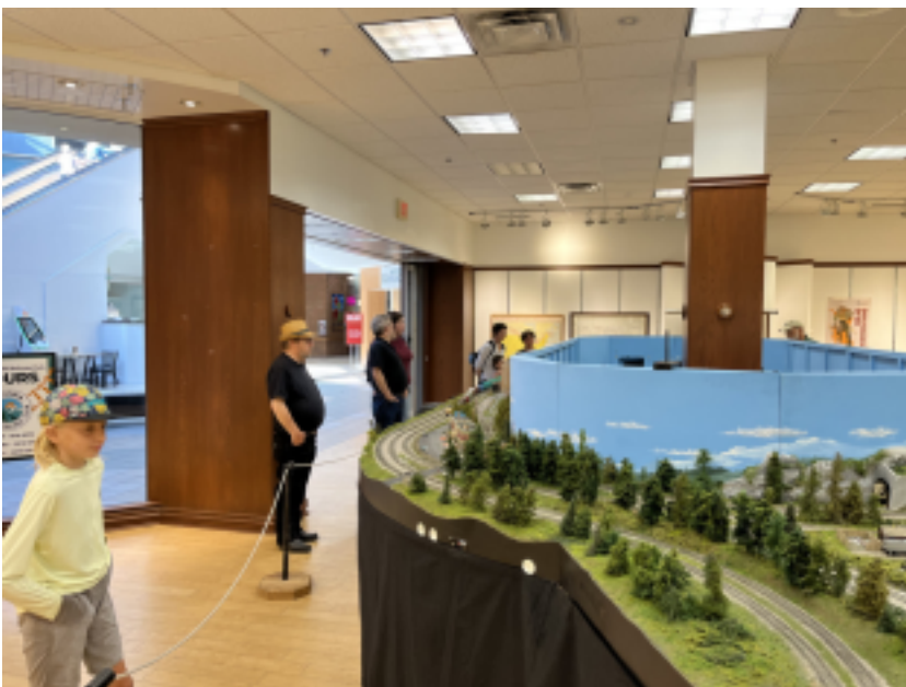
LEFT: The public enthusiastically views the layout as a freight approaches the camera on the left.