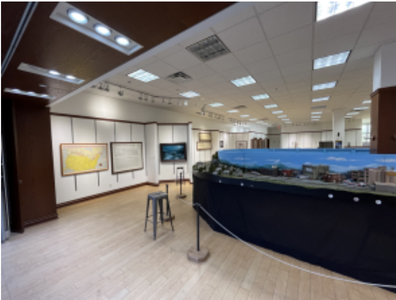
LEFT: The layout, along with walls decorated with displays, as seen from the entrance door.